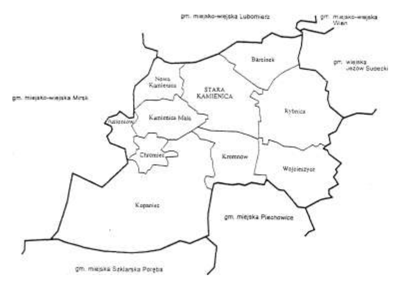
Graph 2. Territorial division of community Stara Kamienica<sup>12</sup>

There live 5152 people in the area<sup>11</sup>, more than half of which are women. The positive tendencies in age structure are: quite big amount of people in 'before productive' age (1128), also big amount of people in productive age (3371) and positive birth rate.